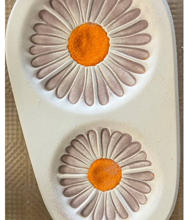
Place Fine Orange Opal over the Sunflower in the center.