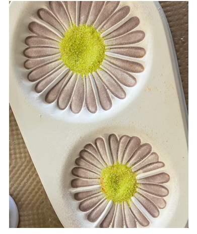
Layer Fine Lemongrass Opal over the Orange Opal.