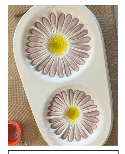
Begin with Powder Sunflower in the centers of the flowers and sift Plum Opal into the petals.