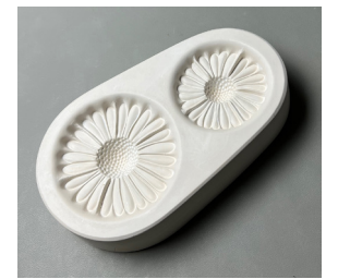
LF 244 Two Coneflowers 9.25" L x 5" W